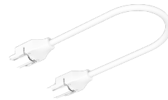
AA-N-M-5W-JUMP-6IN 5 WIRE CABLE TO JUMP MINI NEON TO MINI NEON