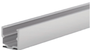
AA-N-PRO-4FT ALUMINUM NEON PROFILE