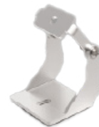
AA-N-PVT (COMES IN PAIRS OF 2 NEEDS TO BE PAIRED WITH AA-N-PRO-4FT)