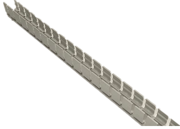
AA-N-HYBRID-PRO-4FT ALUMINUM NEON FLEXIBLE PROFILE