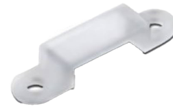
AA-T-12MM-SMC SILICONE PLASTIC CLIP (1 per ft is recommended))