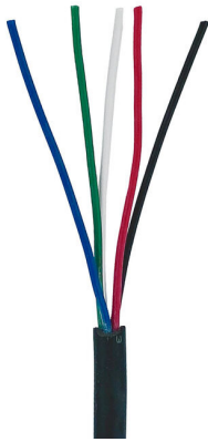
AA-T-5W-LEAD-1FT ADDITIONAL 1FT 20AWG 5 WIRE LEADER CABLE FOR LEADS LONGER THAN 6FT