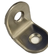
AA-T-E-MC MOUNTING CLIP TO VERTICALLY MOUNT TAPE (ORDER 2 PER FOOT)